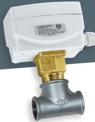
SW-3E / SW-4E with paddle incl. tee fitting