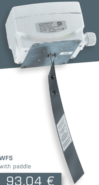
WFS with paddle