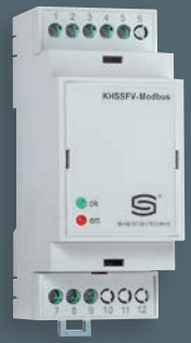
KHSSFV-Modbus Top-hat rail