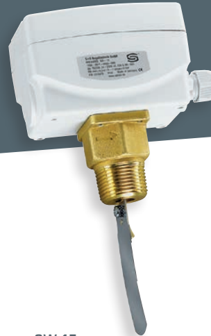
SW-1E with paddle